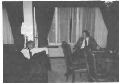
THE STAFF RESTS